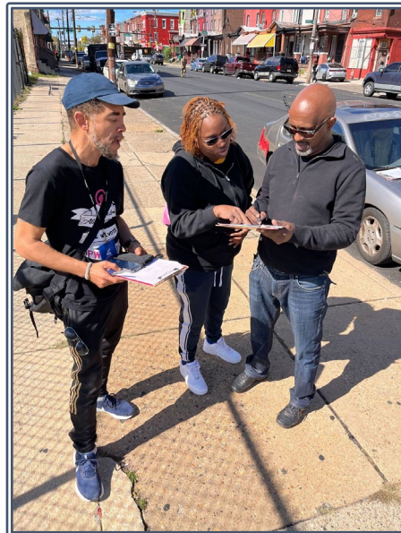
PWN canvassers registering a Philly voter, Oct 8, 2022

Volunteer with us in PA: https://www.mobilize.us/pwn-usa/event/514327/