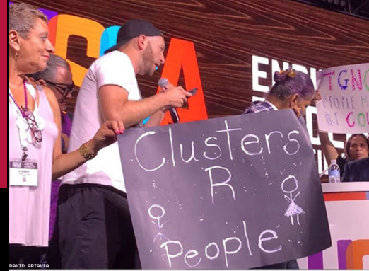
Protestors from across the nation have a message for Dr.

Watch Activists Storm The Stage at USCA, Protesting Neglect From CDC